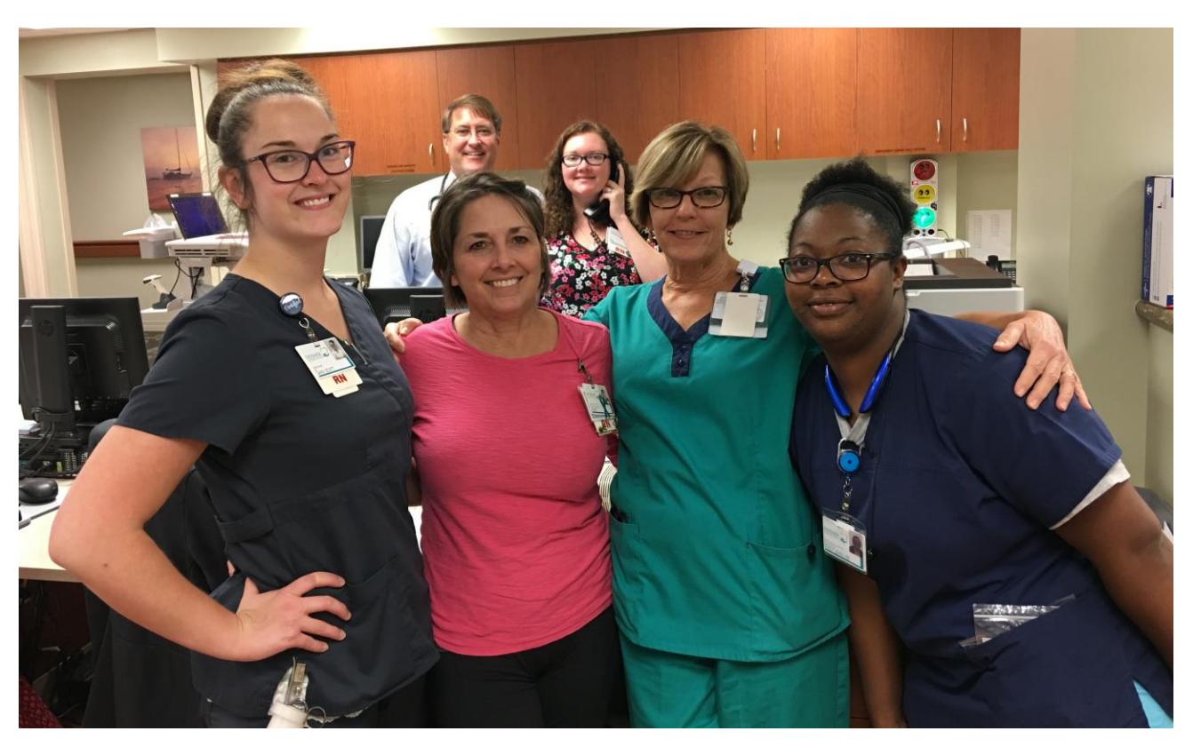
Patient Care Unit