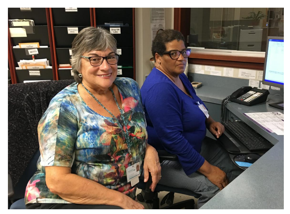
Patient Service Center